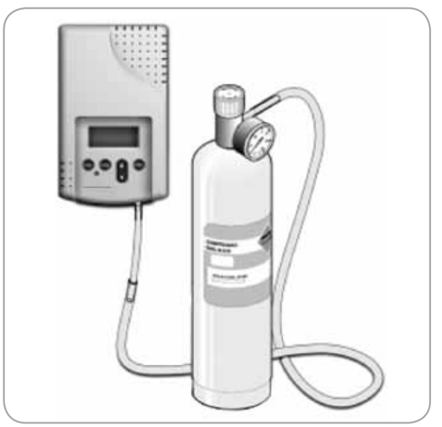
The illustration shows the complete set-up for calibrating a sensor with display.

*Nitrogen gas not included. Requires disposable gas tank: CGA600, 99.95% Nitrogen 20 bar fill pressure, approximately one liter.